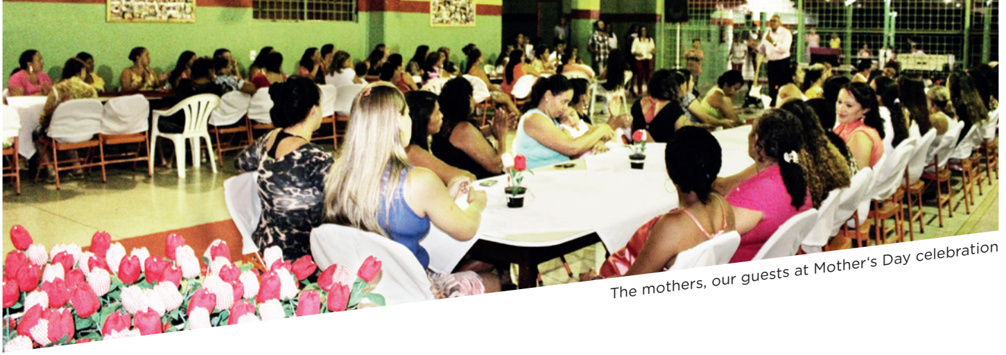
The mothers, our guests at Mother's Day celebration

Due to a water shortage the big water tank on the roof was totally dry in March which is in the middle of the local summer. While water had to be pumped with boilers from the cistern, the opportunity was used to clean the empty container. Because of the intense heat the maintenance of our infrastructure is very labour intensive. In spring roofs, walls and football tables were repaired. Also our children require maintenance of a different kind. Because of the increased demands the sanitary day which was once a month will now be scheduled weekly. Our adolescents are kindly supporting this work which involves cutting the nails, washing the hair and delousing of our youngest kids. This is always a good and funny time. The mood is tremendously peaceful on these days and in general we can say that in recent years much has changed and the atmosphere is much more relaxed and cheerful today. The children now stand in line for their food calm and without jostling, they no longer fight for the provided toys and overall argue less and that despite violence being anchored deeply in these particularly poorer neighbourhoods. These kids have learned from us that they do not have to fight to get enough food or even to be able to use a toy. Some of them are now already a number of years here and have taken a lot of positive things on board, making them models for the younger and newer children.